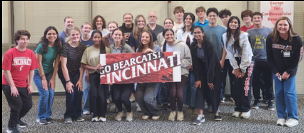
Pictured: MSSI Participants 2025