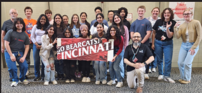
Pictured: MSSI Participants 2025