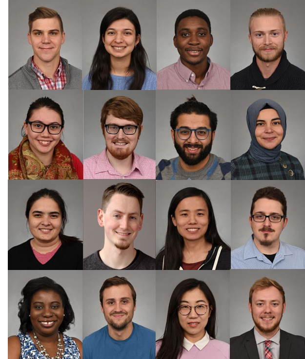
Not pictured: current 1 st year students